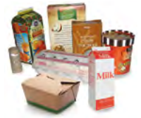
Food Cartons and Boxes