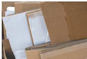
Break down and flatten boxes.