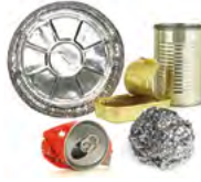
Metal Cans, Aluminum Foil, and Aluminum Pie Pans