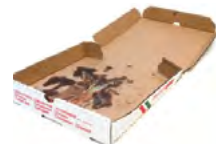
Greasy Pizza Boxes and Paper Towels