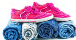
Clothing and Shoes