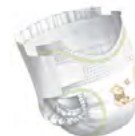
Diapers, Wipes, and Tissues