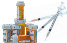
Medical Waste and Medications