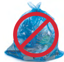
Do NOT bag your recycling.