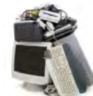
Electronics and Batteries