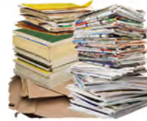
Cardboard, Newspaper, Magazines, and Other Paper