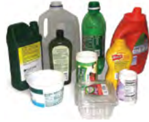
Plastic Bottles, Jugs, and Containers