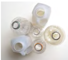
Empty and rinse all food and beverage bottles, jars, and containers. Allow them to dry.