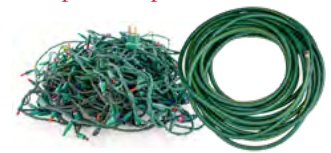
Tanglers (hoses, cords, etc.)